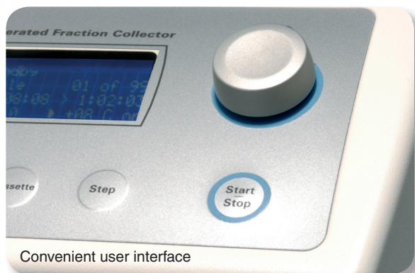
Convenient user interface